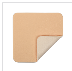
CovaWound™ Silicone & Silicone Lite