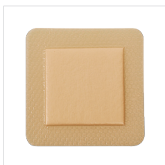
CovaWound™ Silicone & Silicone Lite